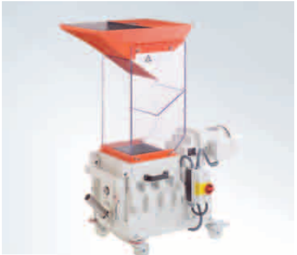
▲ Xtra 2 screenless type of granulator in standard design

The Xtra-Series machines are also very compact and easy to clean. The hardened cutting tools made from high quality steel alloys guarantee a long service life even when processing abrasive plastics. The screenless crusher granulators are available in different configurations and are easy to adapt to specific user requirements.