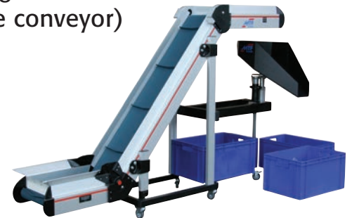
MTF Multi-Rounder MR-A1