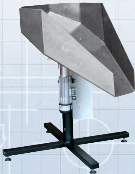
MTF Multi-Rounder MR-S1